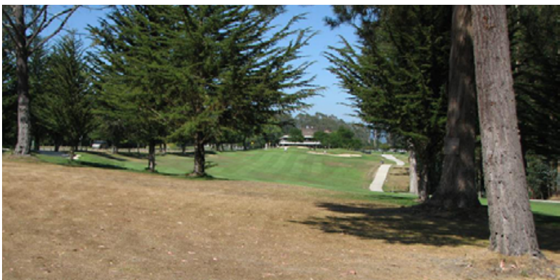
During a drought emergency, the greatest amount of water saving will be achieved by reducing water applications on larger areas of the property, such as the rough.