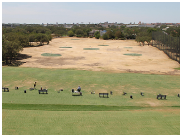
The practice range landing zone at this golf course receives very little water during a drought emergency, while the practice tee is watered regularly to preserve playing quality. Painting the target greens provides great contrast to the drought-stressed bermudagrass.

PAT GROSS is director of the Southwest Region of the USGA Green Section, where drought and water-use efficiency are primary concerns facing golf facilities.