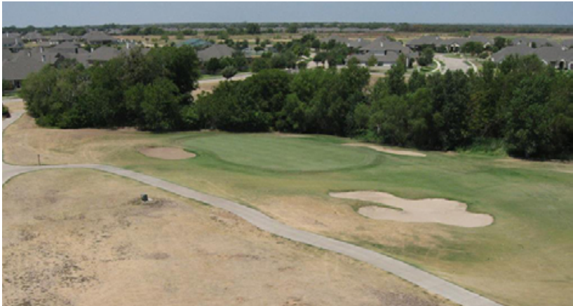
Putting green complexes typically encompass 4 to 6 percent of the total golf course area, and continuing to irrigate these areas helps to maintain acceptable playing quality while using relatively little water.