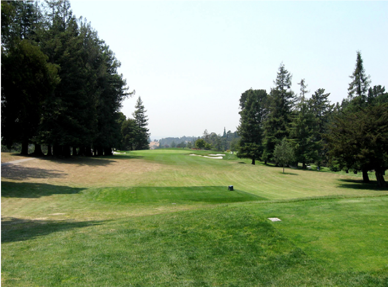
During a drought emergency, putting green complexes and teeing grounds typically receive the highest priority for irrigation, while the rough receives the lowest priority.