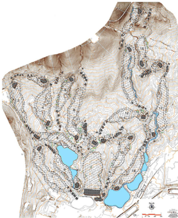
An accurate map of the golf course property is an essential starting point for developing a drought-emergency plan so that various areas can be measured and documented.